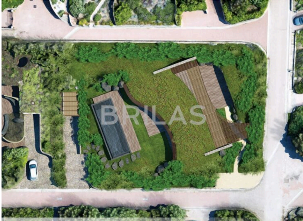
LE IMMAGINI PROPOSTE SONO DA CONSIDERARSI PURAMENTE INDICATIVE E NON VINCOLANTI