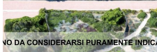
LE IMMAGINI PROPOSTE SONO DA CONSIDERARSI PURAMENTE INDICATIVE E NON VINCOLANTI