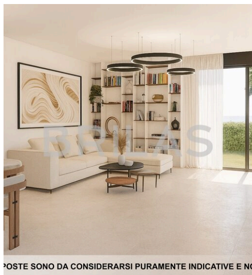
IMMAGINI PROPOSTE SONO DA CONSIDERARSI PURAMENTE INDICATIVE E NON VINCOLANTI