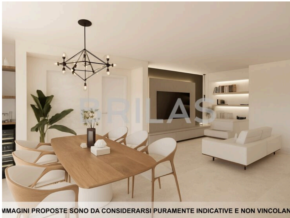
IMMAGINI PROPOSTE SONO DA CONSIDERARSI PURAMENTE INDICATIVE E NON VINCOLANTI