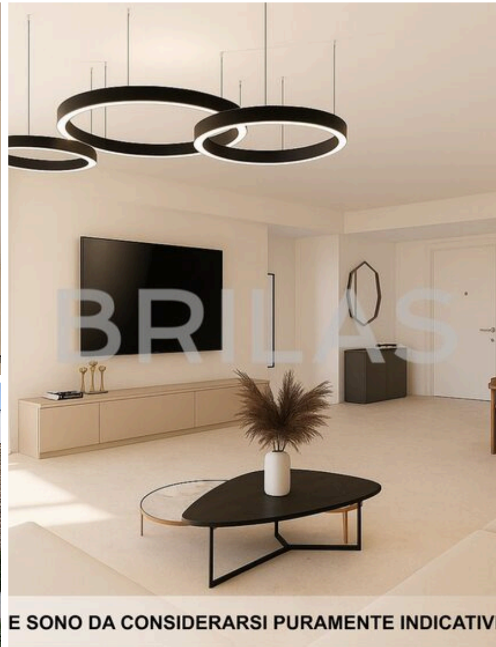
IMMAGINI PROPOSTE SONO DA CONSIDERARSI PURAMENTE INDICATIVE E NON VINCOLANTI